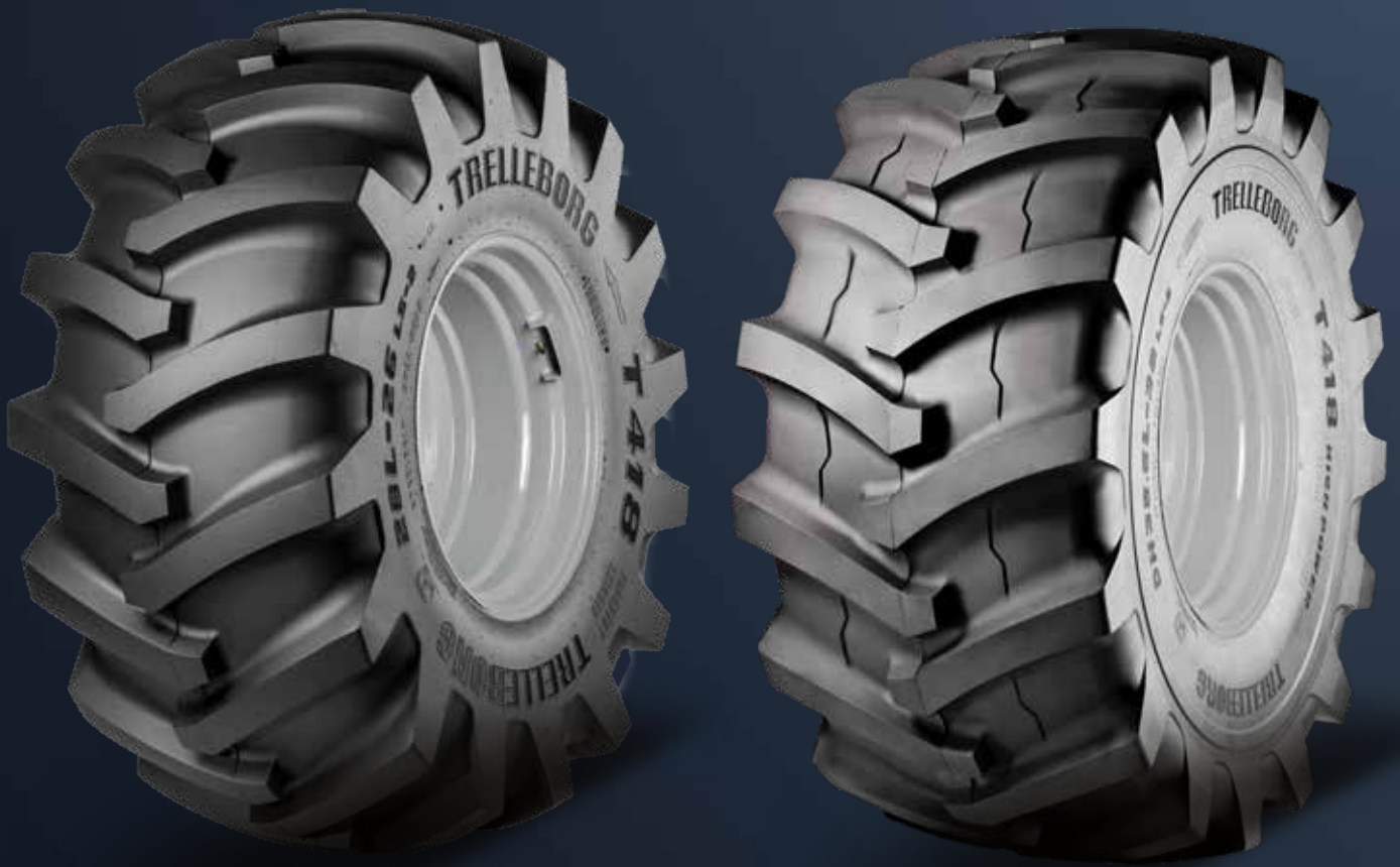
Forestry Skidder T418 High Power