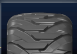
Wide flat tire profile Excellent compatibility with tracks.