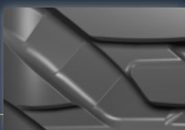
Inter-lug terraces Good self-cleaning.