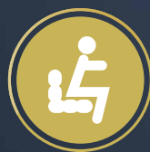
EXCELLENT RIDE COMFORT