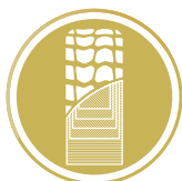
ALL-STEEL RADIAL CONSTRUCTION