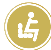
EXCELLENT RIDE COMFORT